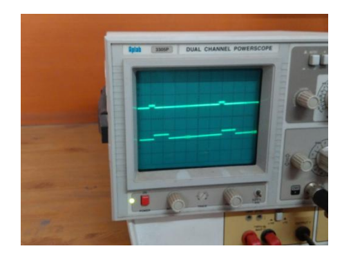
Fig. Output waveforms of zero crossing detector

The waveforms of zero crossing detector are as follows: